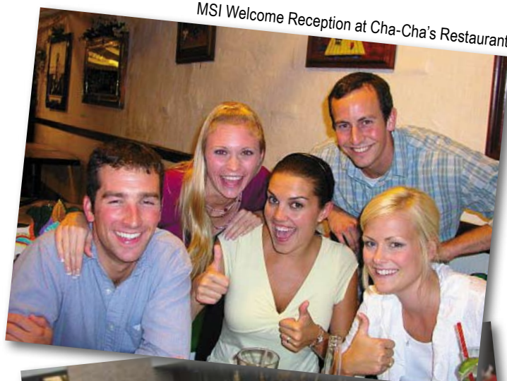
MSI Welcome Reception at Cha-Cha's Restaurant