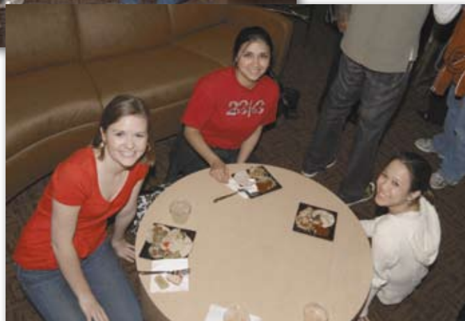
Students enjoying the comforts of the lounge shortly after the ribbon cutting ceremony