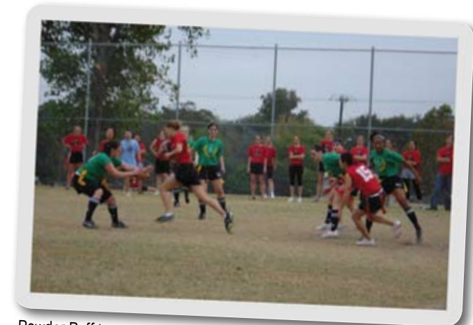
Powder Puff team members giving their all to raise money for the cause