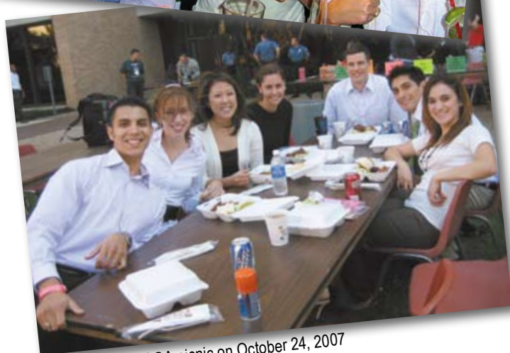
Students at the SGA picnic on October 24, 2007