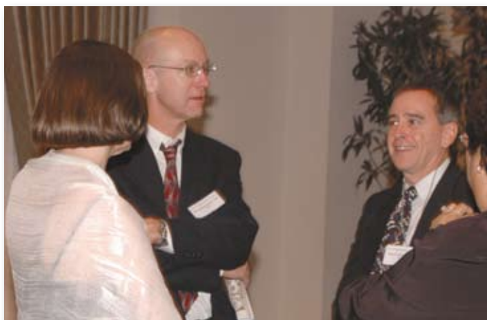
Alumni from the Class of 1982