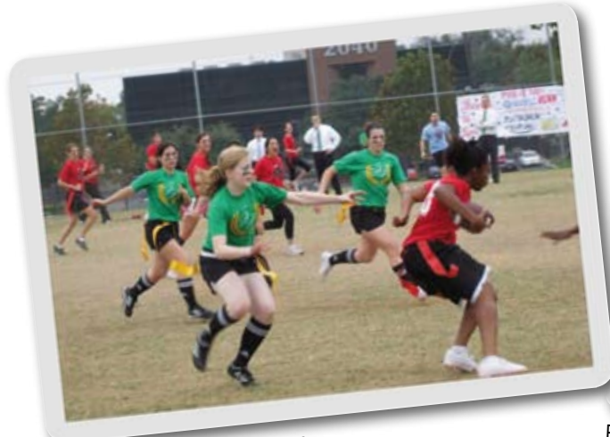
MSI vs. MSII Powder Puff game

as superman during halftime. The second year team was victorious in a close fought battle. Thanks to the Alumni Association for a very generous contribution that went to provide sandwiches for lunch and helped us to raise over $5000.00 for the Komen Foundation!