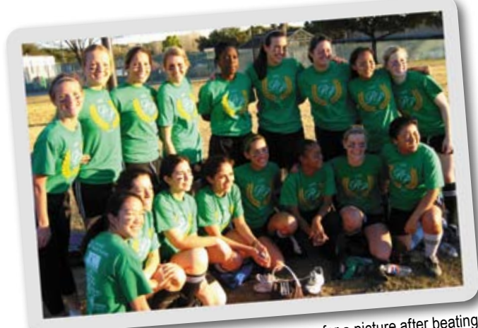
Combined MSI/MSII Powder Puff team poses for a picture after beating St. Mary's Law School on January 12, 2008